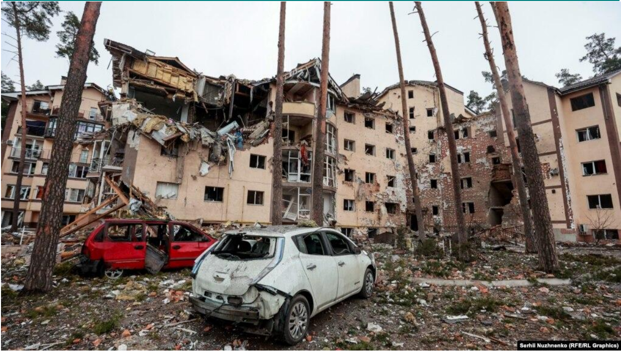
The building was destroyed by the russians. Irpin. The photo was created on March 2, 2022. https://www.radiosvoboda.org/a/news-irpin-pidryv-kolii/31737420.html (Revised: 10.07.2024)

February 24 remained in my memory for the rest of my life only as a huge horror that was brought to my Ukrainian land by terrorist russia.