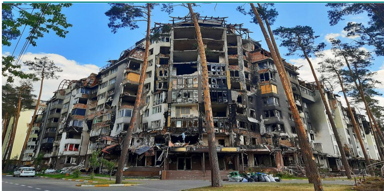
A destroyed residential building in Irpin during the Russian invasion. Residential complex "Irpinski Lyvky". The photo was created on June 16, 2022. Photo: Rasal Hague.

https://uk.wikipedia.org/wiki/Файл:A_damaged_building_Irpin_Lyvky.jpg (Revised: 10.07.2024)