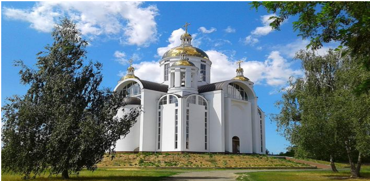
Church of the Holy Apostle Andrew the First-Called (Orthodox Church of Ukraine). Bucha. The photo was created in 2017. Photo: Rasal Hague.

https://uk.wikipedia.org/wiki/Файл:Мозаїка_Буча_(20210510).jpg (Revised: 10.07.2024)