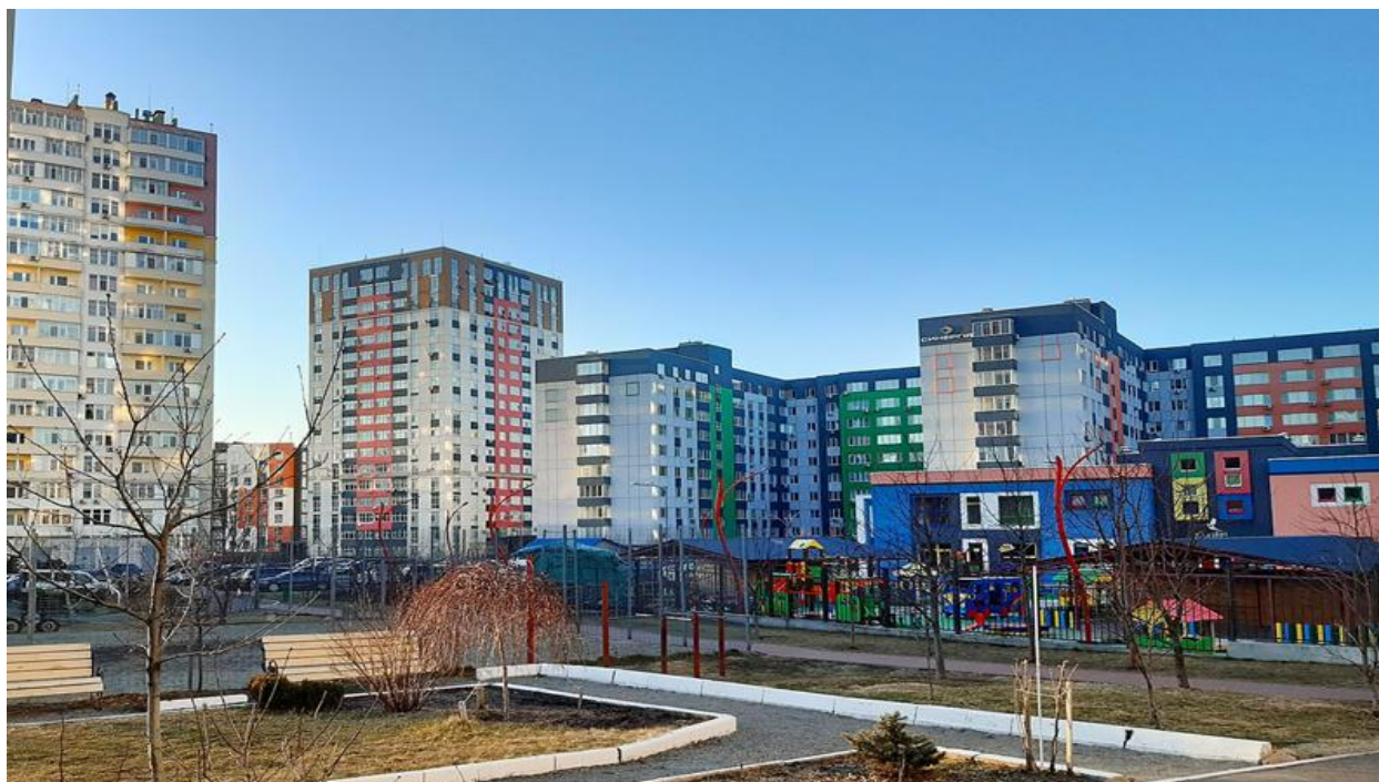
“Synergia-3” housing estate a few days before the russian invasion. Irpin. The photo was created on February 19, 2022.

Irpin is a Ukrainian town in the suburbs of Kyiv, located on the Irpin River, in the Buchansky district of Kyiv region.