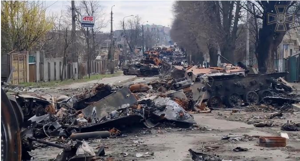
Vokzalna Street of Bucha where a russian military column was destroyed on 27 February 2022. The photo was created on April 4, 2022.

The Armed Forces of Ukraine resisted the russian offensive in the western suburbs of Kyiv – Irpin, Bucha, and Hostomel, which were the most dangerous places in the Kyiv region.