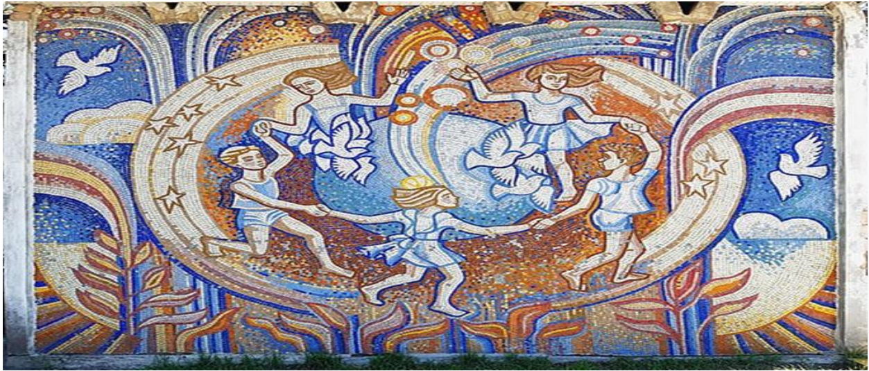
Mosaic on Yaroslav the Wise Street. Bucha. The photo was created in 2021. Photo: Rasal Hague.

https://uk.wikipedia.org/wiki/Файл:Мозаїка_Буча_(20210510).jpg (Revised: 10.07.2024)