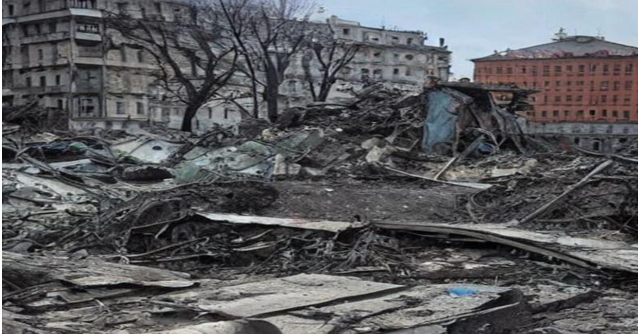
Volnovakha after heavy bombing. February 27, 2022. Author: ADifferentMan.

On February 26, around 1:00 p.m., a large-scale shelling with hail and artillery began in the town. Lights and communication were turned off, a tank exploded near our house. Feelings of fear and security disappeared completely.