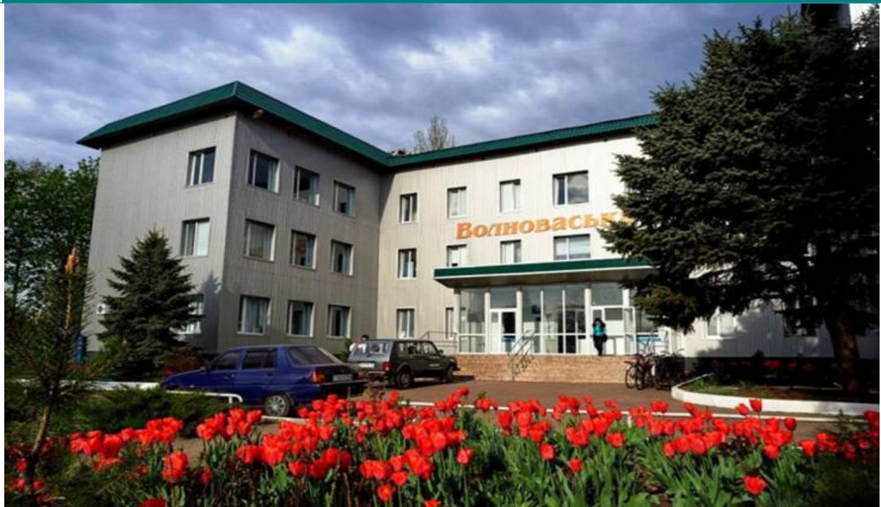
The first city hospital in Volnovakha before russian invasion. 2021.