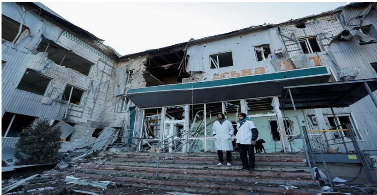
The first city hospital in Volnovakha after shelling by russian terrorists. March 12, 2022.