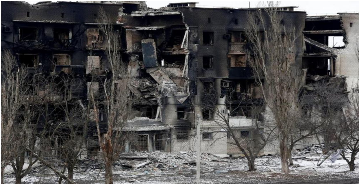
Volnovakha after shelling of russian terrorists. March 12, 2022. REUTERS.

https://uk.wikipedia.org/wiki/Волноваха#/media/Файл:Volnovakha_shelled.jpg (Revised: 10.07.2024)