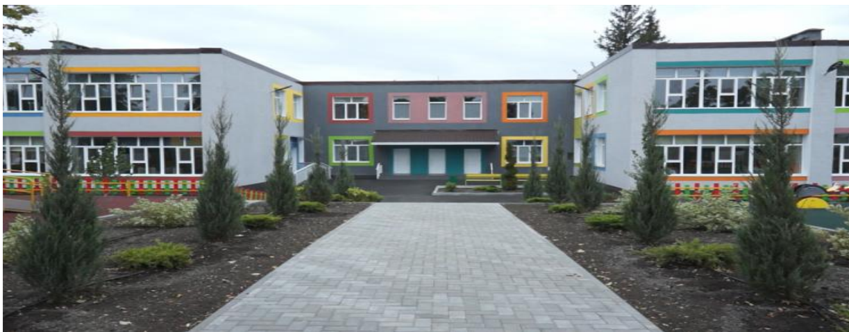
Kindergarten № 8 in Volnovakha before the russian invasion. 2020.