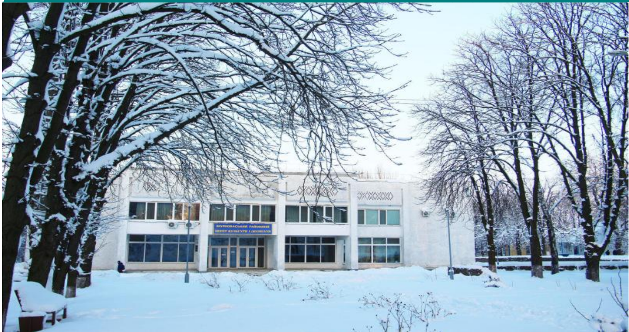
Volnovasky District Center of Culture and Leisure before the russian invasion. 2020.

https://freeradio.com.ua/perspektivi-vs-vijna-jak-volnovaha-namagaietsja-ne-vtratiti-svij-shans-na-decentralizaciju/