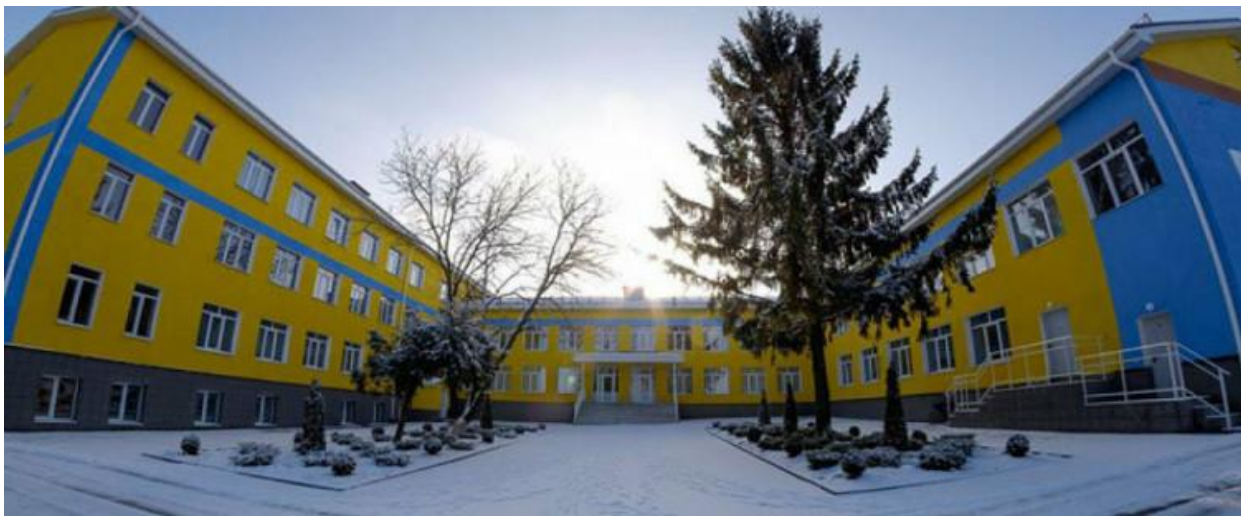
Renovated school No. 5 in Volnovakha before the russian invasion. 2020.

I am a first-year student at Grinchenko University. I am studying Law. I will tell you the history of my hometown Volnovakha in the russian-Ukrainian war of 2014 – 2024.