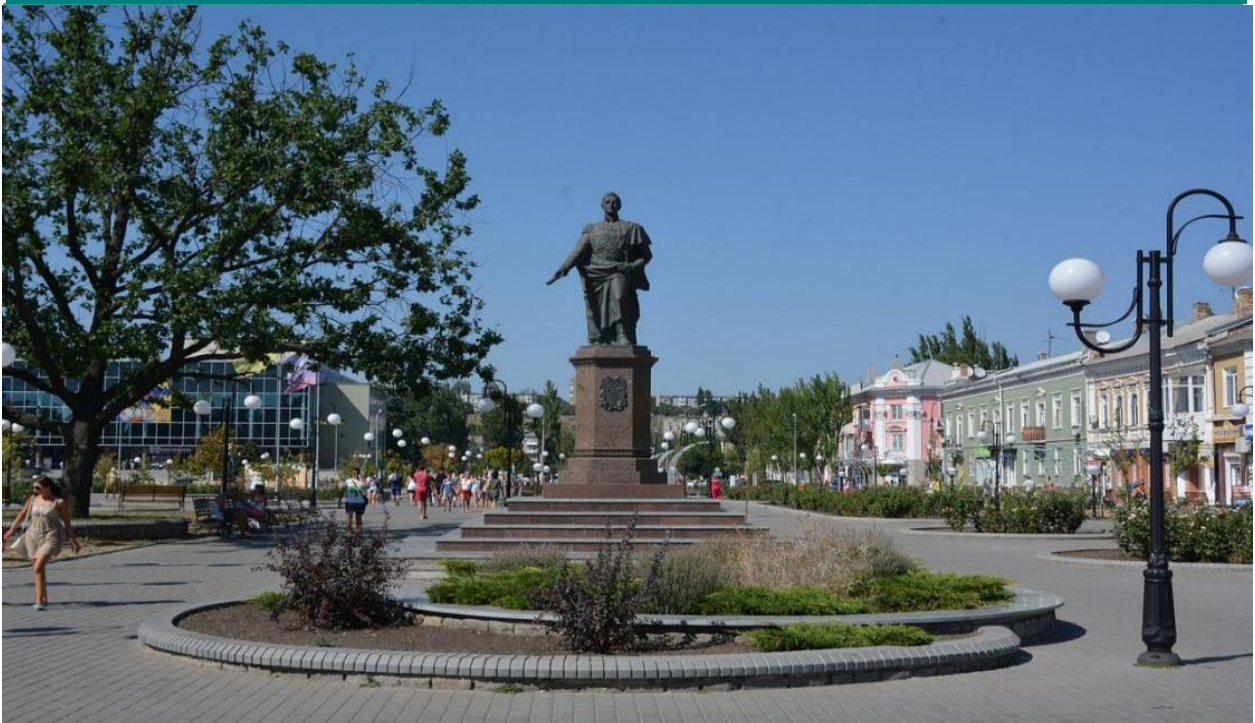
Berdyansk city center, Azov Avenue. The photo was created on August 15, 2014.

https://uk.wikipedia.org/wiki/Проспект_Азовський#/media/Файл:Berdyans'k_Lenina_prospekt...vulytsya_01_(YDS_8167).JPG