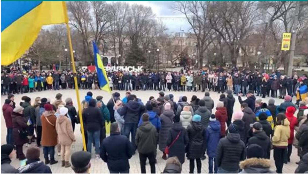
Berdyansk, pro-Ukrainian rally on March 6, 2022. https://war.telegraf.com.ua/ukr/ukraina/2022-03-11/5699055-v-berdyanske-gvardeytsy-putina-vyglyadyat-kak-bosyaki-boyatsya-pravogo-sektora-i-mitingov (Revised: 10.07.2024)