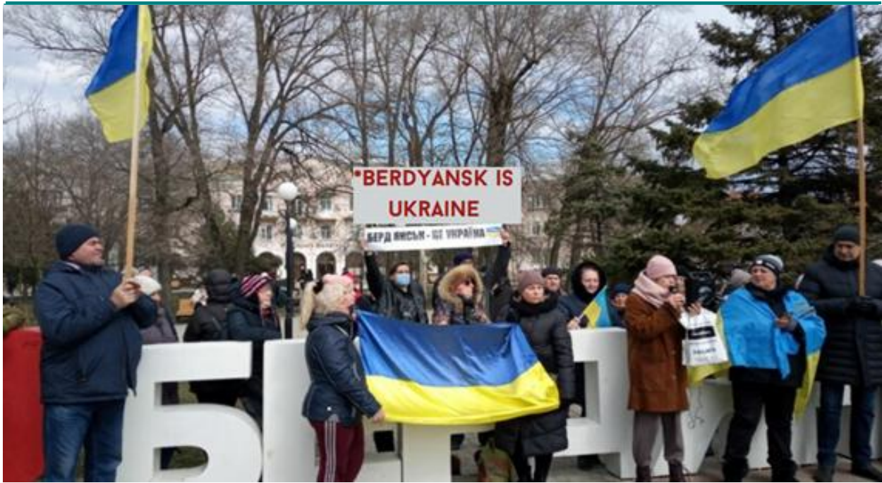
Berdyansk, pro-Ukrainian rally on March 14, 2022. https://hvylya.net/news/248977-v-berdyanske-okkupanty-pytavutsya-zapugivat-protestuyushchih-mestnyh-zhiteley-foto (Revised: 10.07.2024)