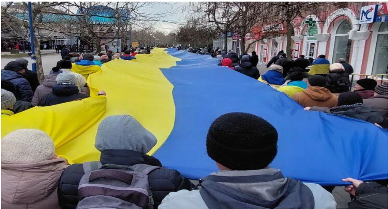
Residents of Berdyansk carried a large Ukrainian flag through the city on March 16, 2022. https://gordonua.com/ukr/news/war/meshkantsi-berdjanska-znovu-vijshli-na-proukrajinskij-miting-zelenskij-nazvav-jih-horobrimi-ljudmi-1600294.html (Revised: 10.07.2024)