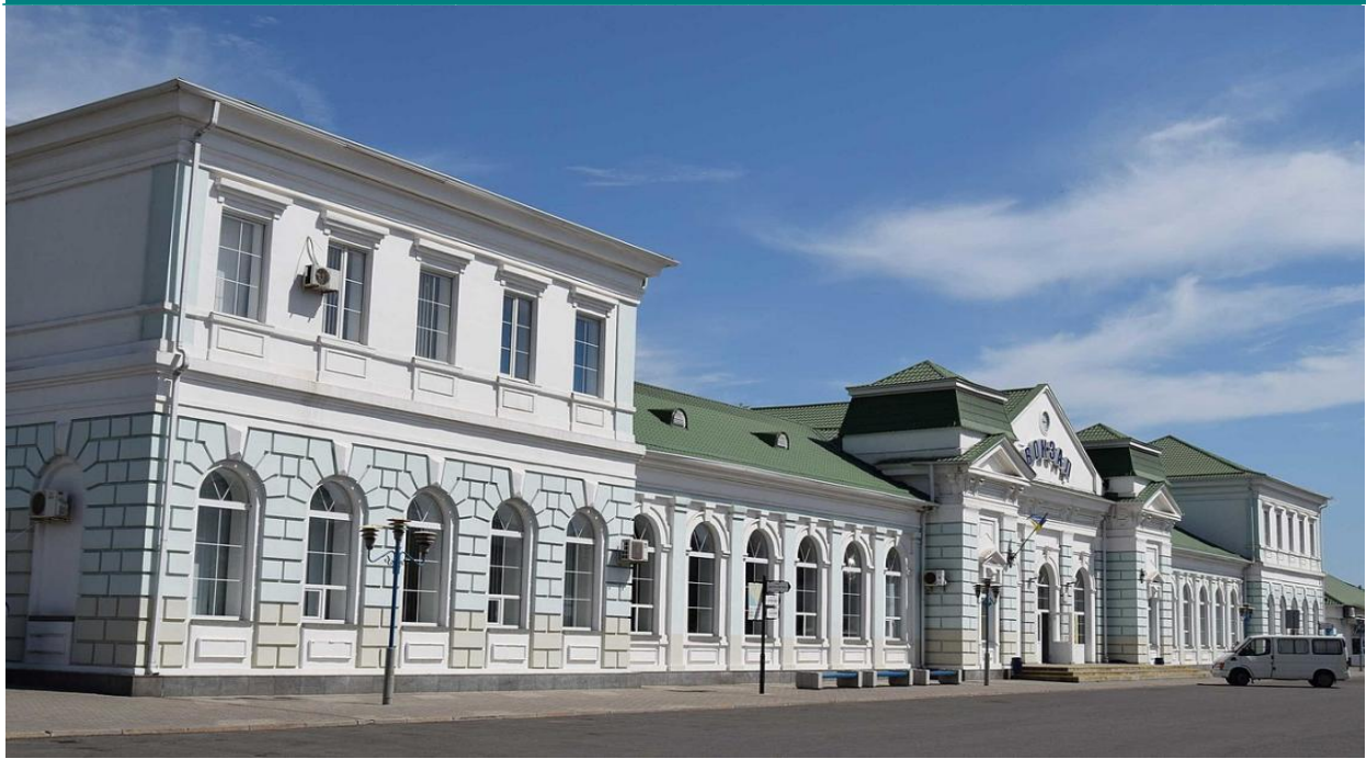
Berdyansk railway station. The photo was created on June 9, 2019.