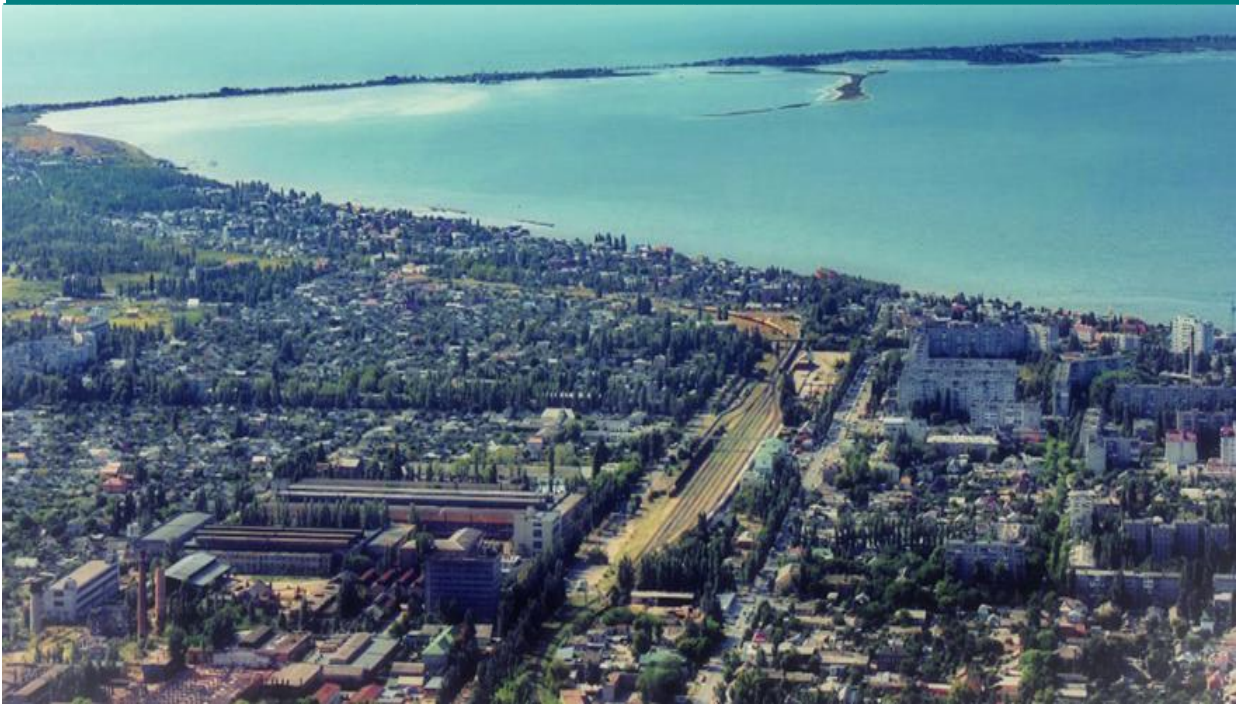
Berdyansk is the heart of Azov. The photo was created on July 25, 2013. Author: Insaitman.

https://uk.wikipedia.org/wiki/Бердянськ#/media/Файл:Berdyansk_The_Heart_Of_Azov.jpg (Revised: 10.07.2024)