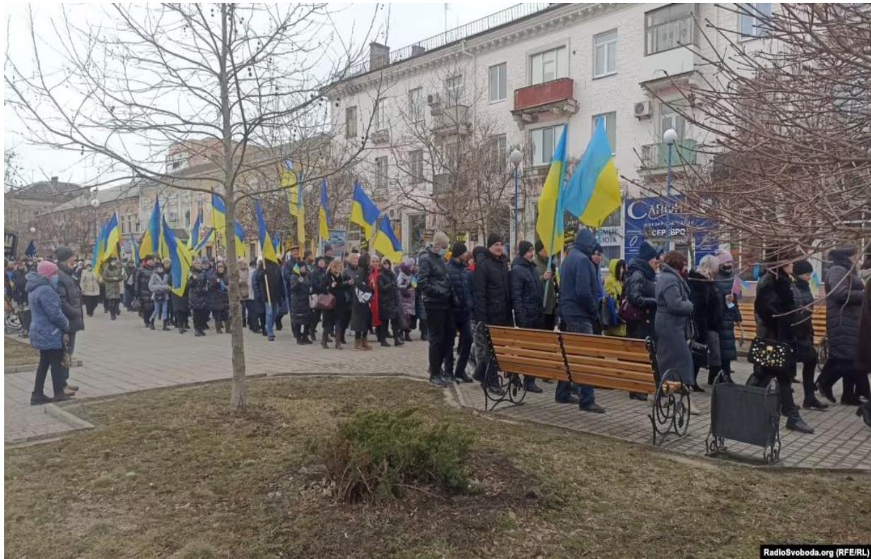
Action for the unity of Ukraine in Berdyansk. February 28, 2022.

However, sometimes I forgot about the fear. My family and I took part in rallies several times. Because we still hoped for the best. I felt it. I was so proud of the Ukrainian people, who together with us stood unarmed in front of soldiers with machine guns.