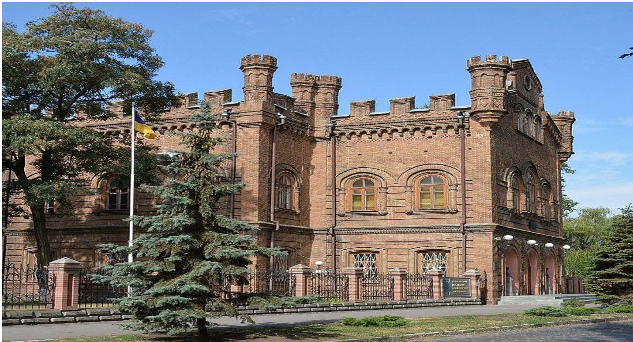
Berdyansk State Pedagogical University. The photo was created on August 17, 2014.