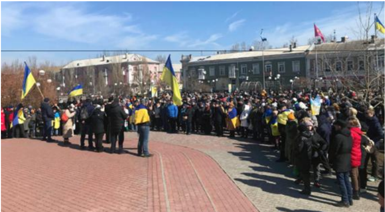
Peaceful rally in Berdyansk, March 13, 2022. https://suspilne.media/zaporizhzhia/217074-mitingi-za-ukrainu-zalakovanna-okupantami-ta-pitanna-evakuacii-aka-situacia-u-berdanku/ (Revised: 10.07.2024)