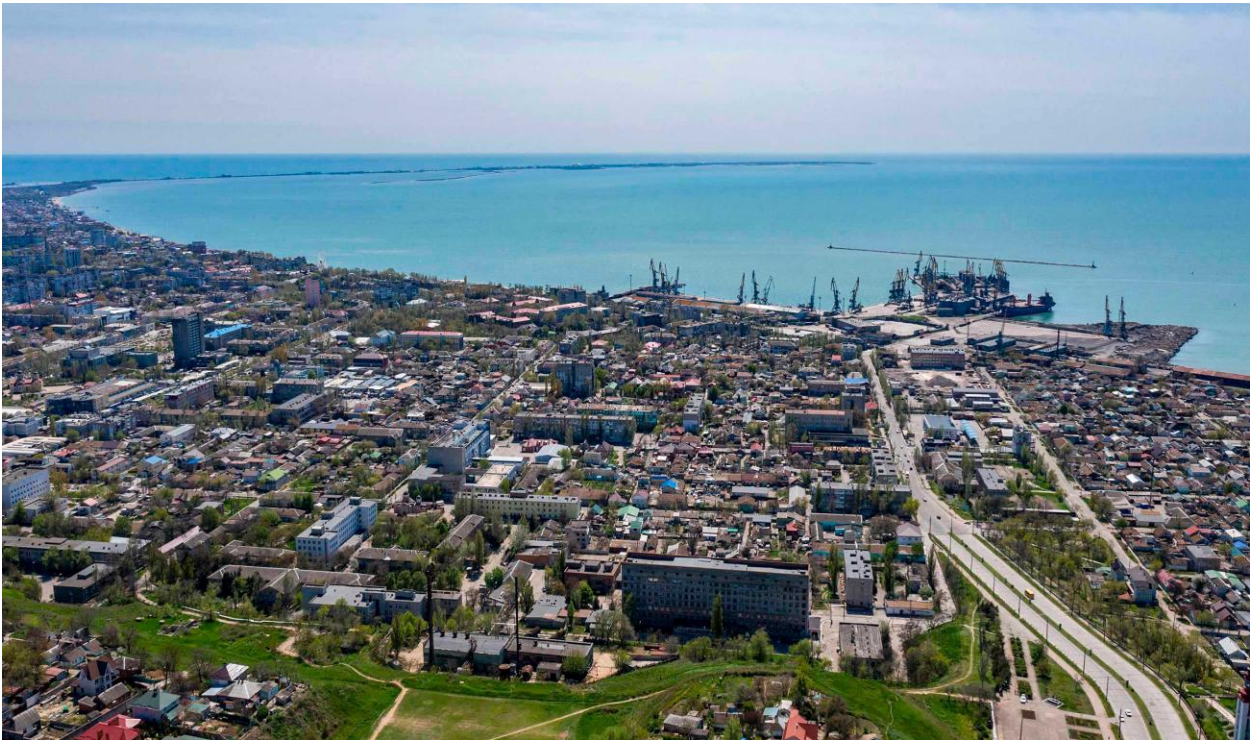
Berdyansk, April 2022. https://www.radiosvoboda.org/a/novyny-pryazovya-berdyansk-okupatsiya-zsu/32267842.html (Revised: 10.07.2024)

https://uk.wikipedia.org/wiki/Бердянськ#/media/Файл:Berdyansk_The_Heart_Of_Azov.jpg (Revised: 10.07.2024)