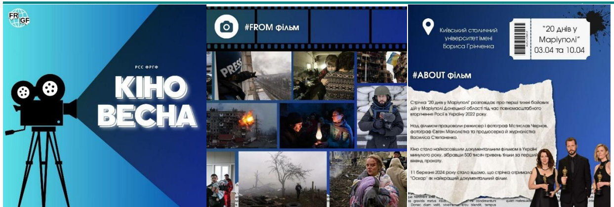
Advertisement of Students' Government Council of Faculty of Romance and Germanic Philology.